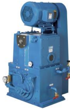
Single-Stage Oil-Sealed Rotary Piston