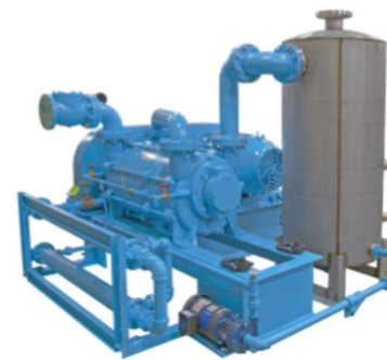
Custom Solutions to 12,000