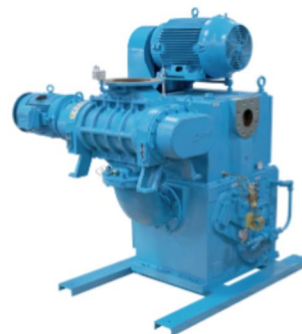
Liquid Ring & Booster/Piston