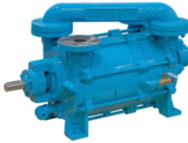
Two-Stage Liquid Ring