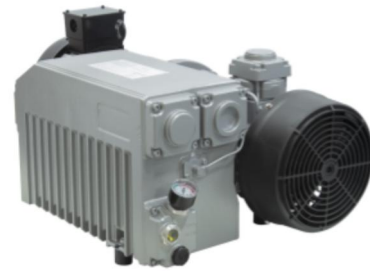
Single-Stage Oil-Sealed Rotary Vane