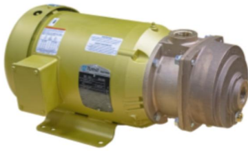
Single-Stage Liquid Ring