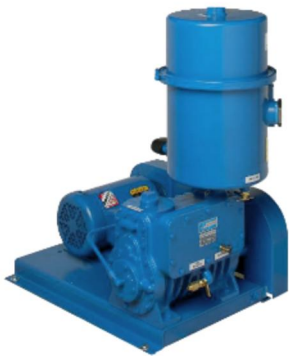
Single-Stage Duplex Oil-Sealed Rotary Piston